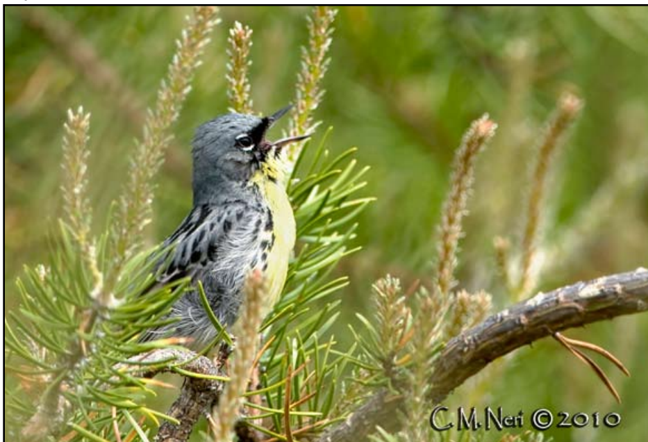
WPBO field trip participants were treated to a rare UP sighting of a Kirtland's Warbler. See p. 5

Derby Hill is another eastern Spring site that experienced low numbers this season. Derby Hill is located on Lake Ontario near Syracuse, New York. They operate their count at a similar time to WPBO. In 2010 Derby Hill had a 13.7% decrease in the raptors observed. This is similar to the 16.6% decrease that was witnessed here at Whitefish Point. Derby Hill's Sharp-shinned Hawk count was down 37%; Broad-winged Hawk down 14%; Red-tailed Hawk down 21%; Rough-legged Hawk down 54%; Golden Eagle down 31%, all compared to the last 5 year average. This may give a little weight to the argument that some birds of prey passed through at a different time this year.