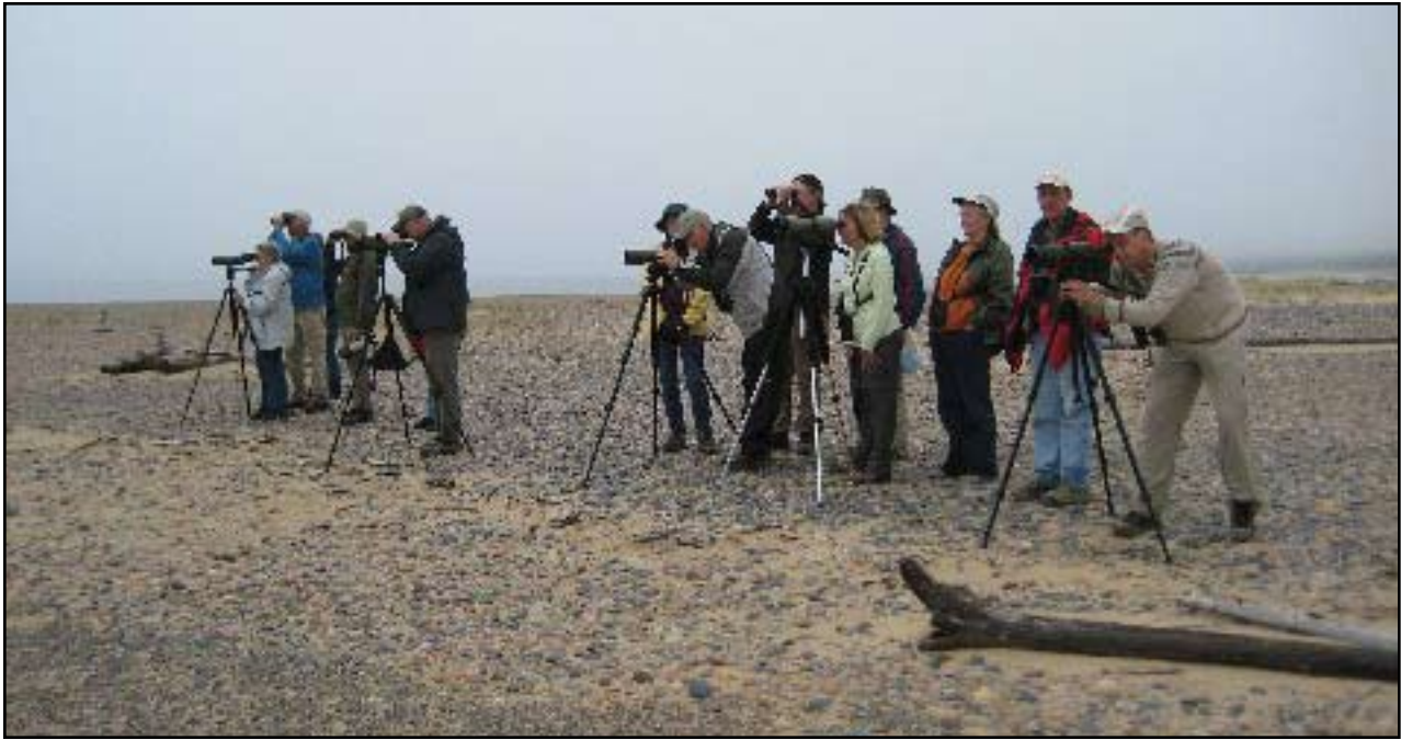
Tour members on Breeding Birds of the Eastern UP trip view a Piping Plover.